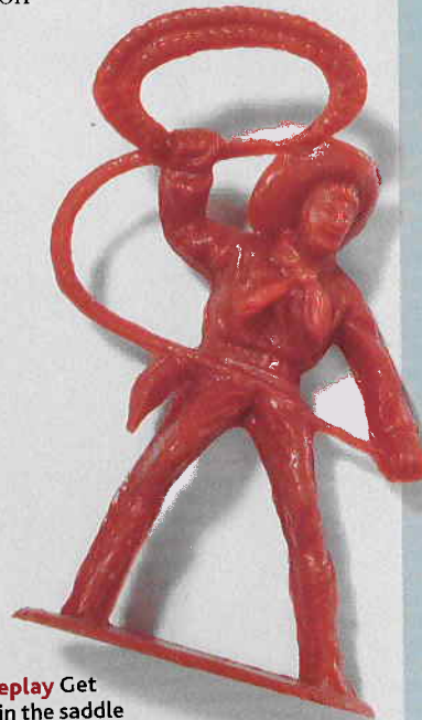
63 Horseplay Get back in the saddle again at the Mayan Dude Ranch.